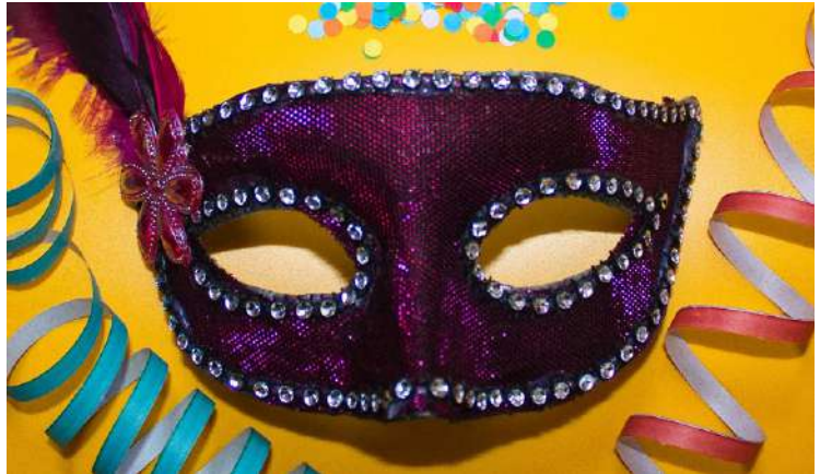
Mardi Gras Celebration February 13th from 2:00pm – 3:00pm

We will be in our favorite team's attire! Residents will enjoy tailgating and talking a good game! Come join in the Super Bowl celebrations!